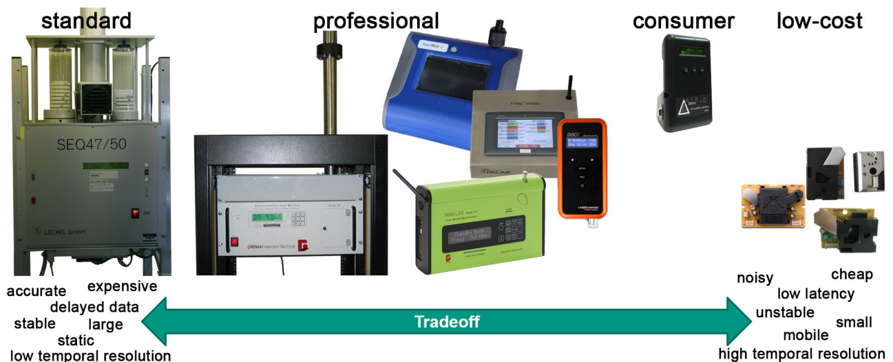
Figure 1. Range of measurement technology.

The main objective of this project is the development of an overall system for the recording, visualization and prediction of the spatial distribution of air pollutants in urban atmospheres that is relevant to the living environment of citizens. Existing data sources will be decisively supplemented by novel dynamic data sources. The “SmartAQnet” project aims to implement an intelligent, reproducible, finely-tuned (spatial, temporal), yet cost-effective air quality measuring network, initially in the model region of Augsburg, Germany. An overview of the full range of available measurement technologies is shown in Figure 1.